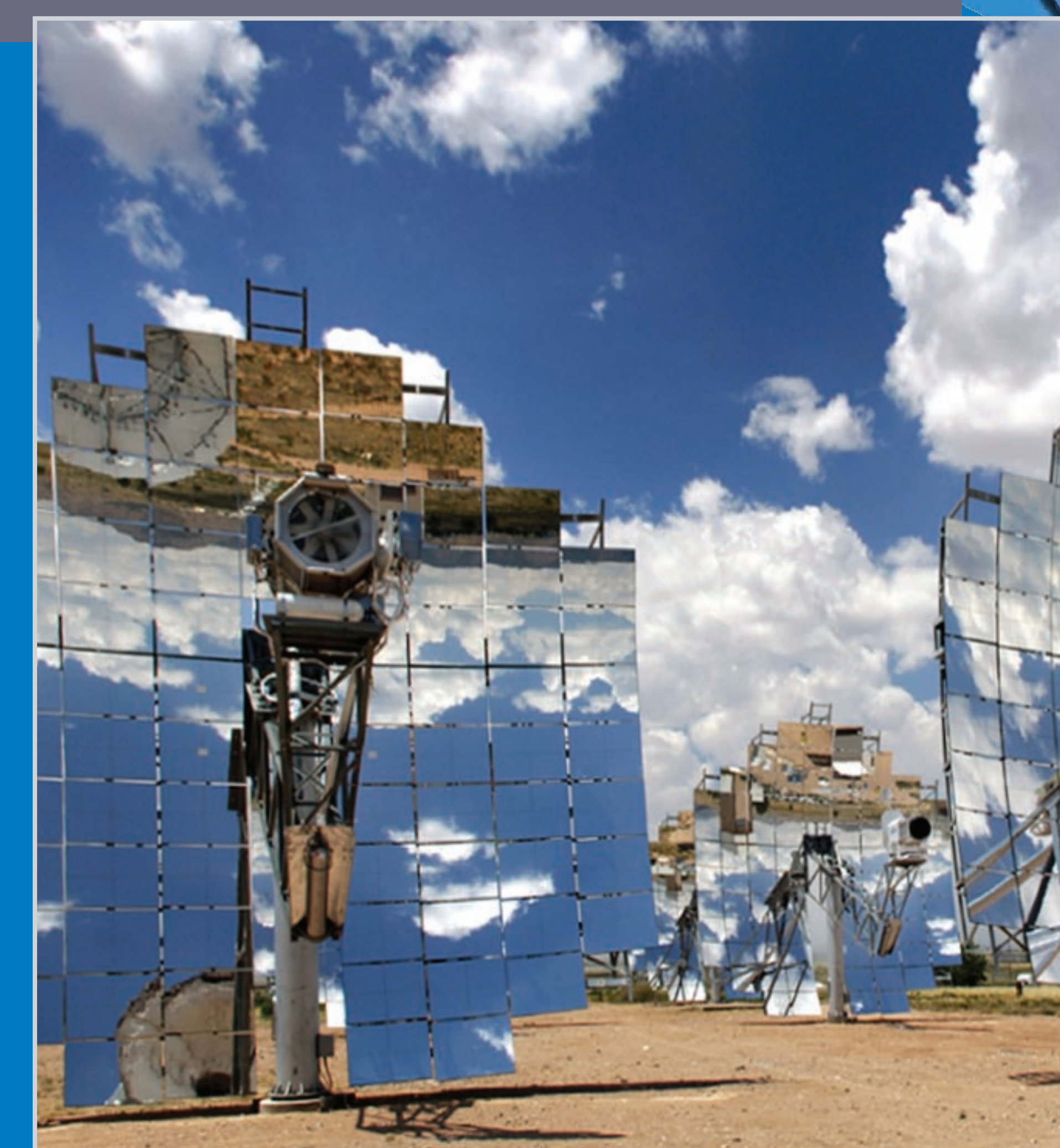
These new record-performing dish engine systems are being commercialized.