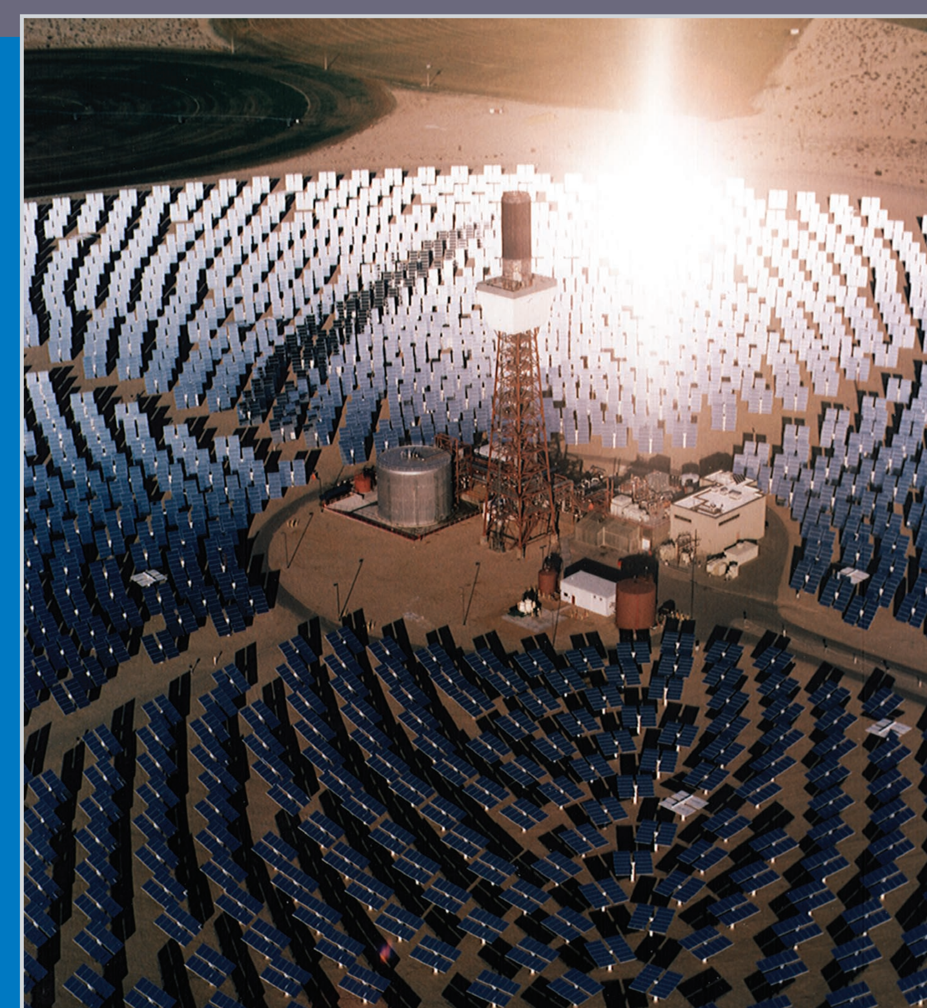
This 10-MW power tower facility known as Solar Two near Barstow, California, demonstrated molten salt storage.