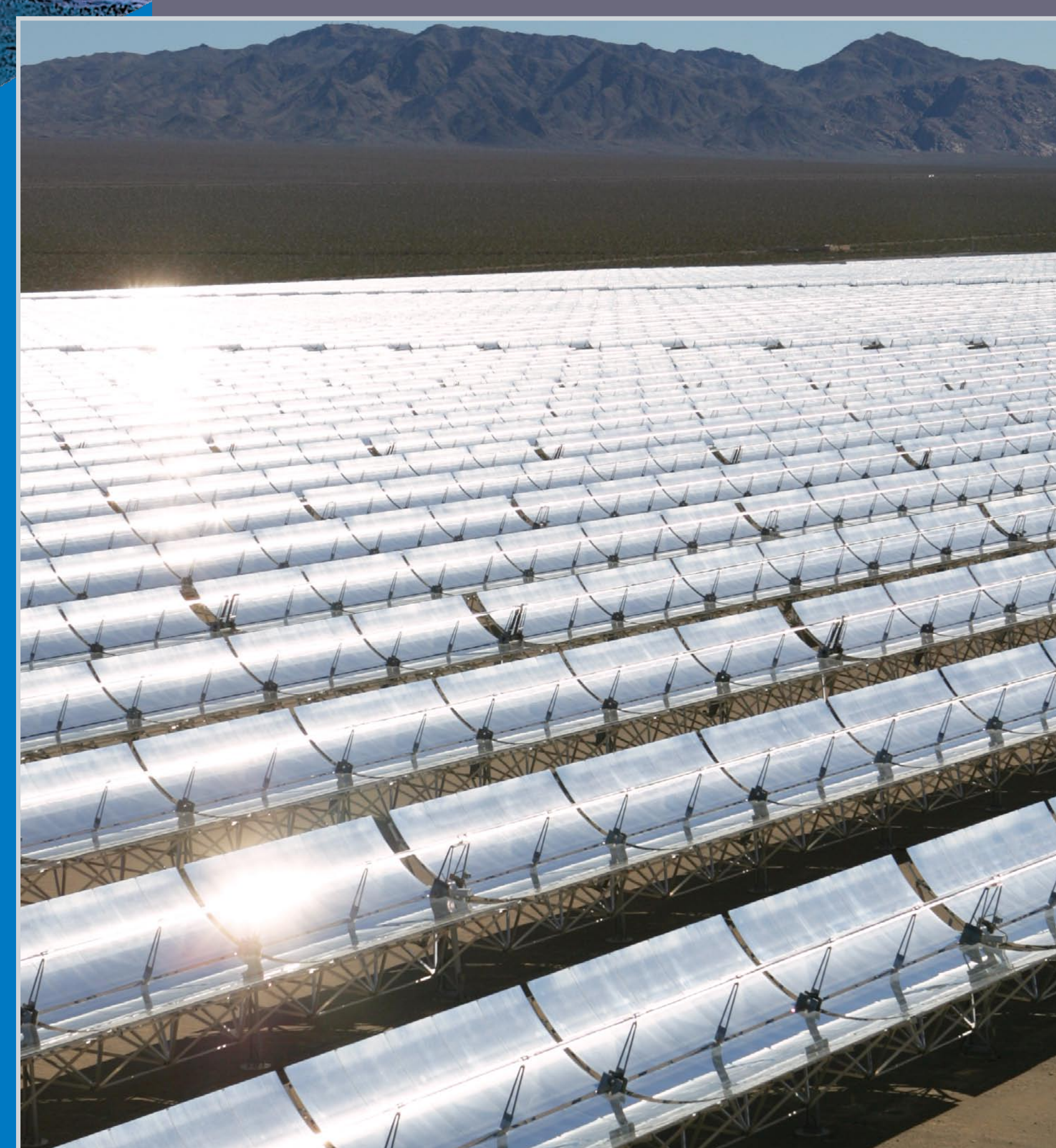
A section of the parabolic troughs from the Nevada One project tracking the sun.